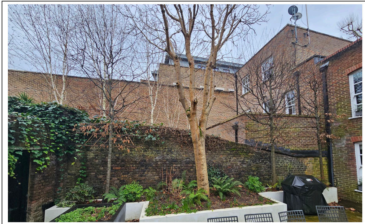
Image 1: Trees T2 Ash and tree group G1 Pleached hornbeam to be removed