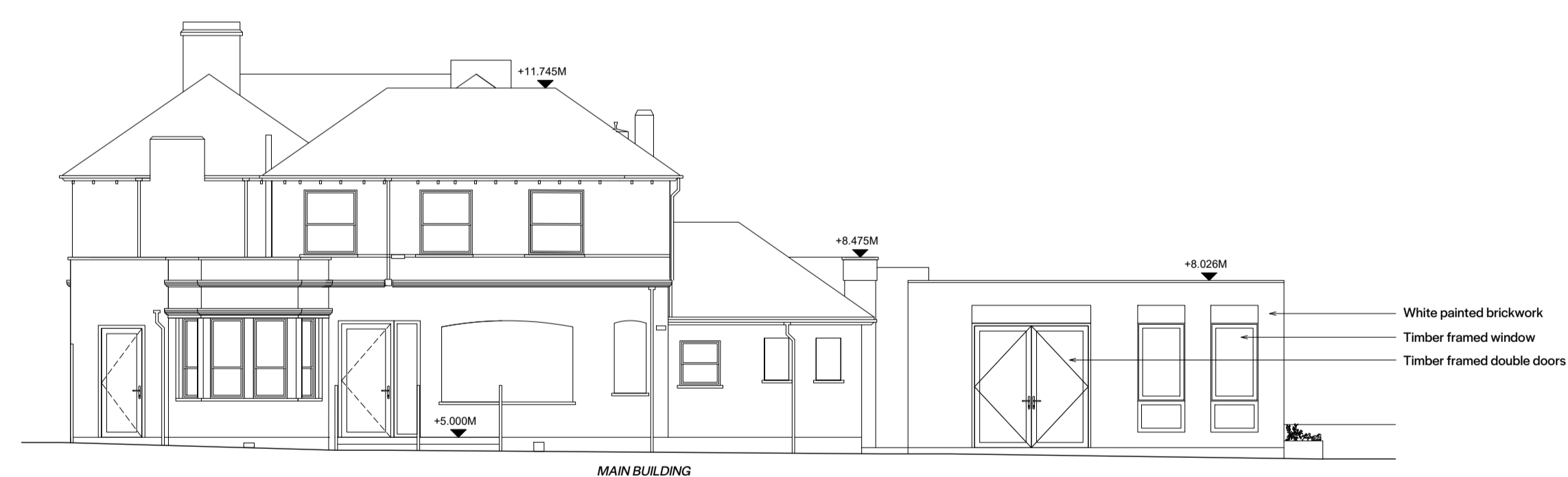
3 Proposed Elevation 3 (SW) 1:100