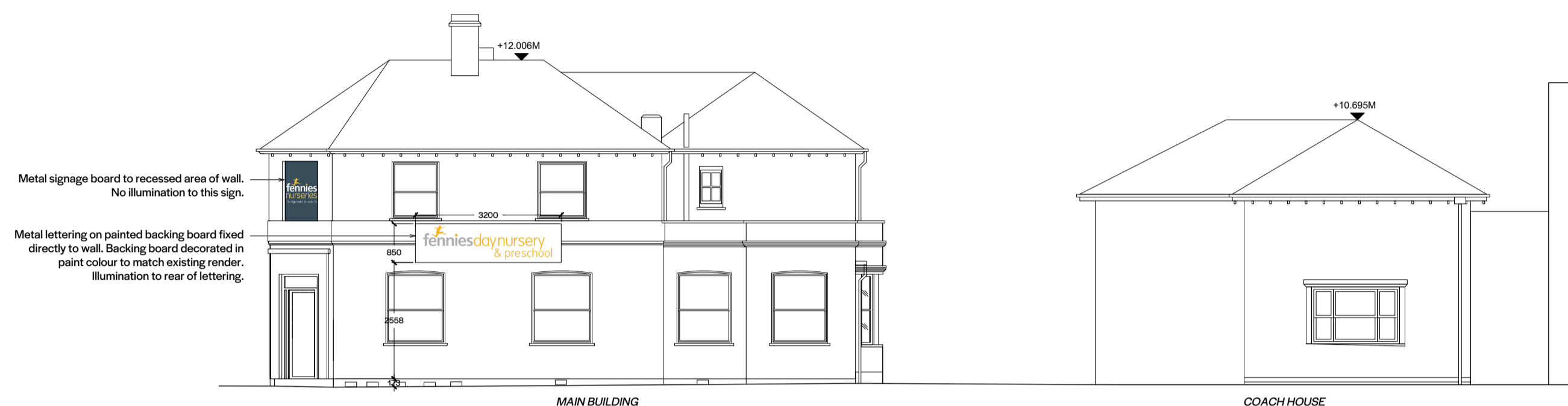
1 Proposed Elevation 1 (NW) 1:100