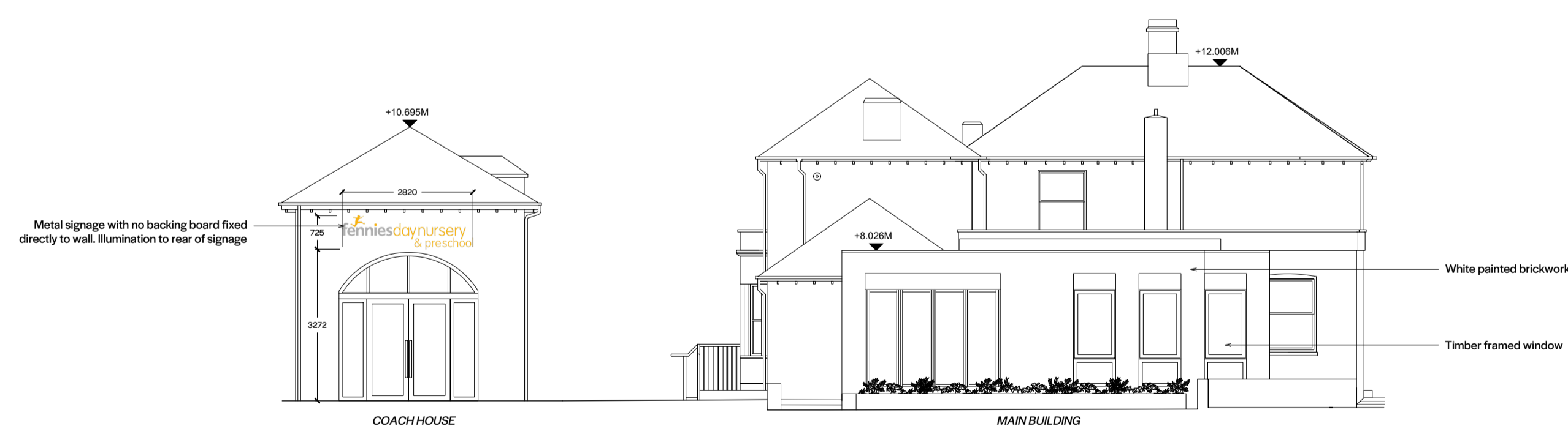
4 Proposed Elevation 4 (SE) 1:100