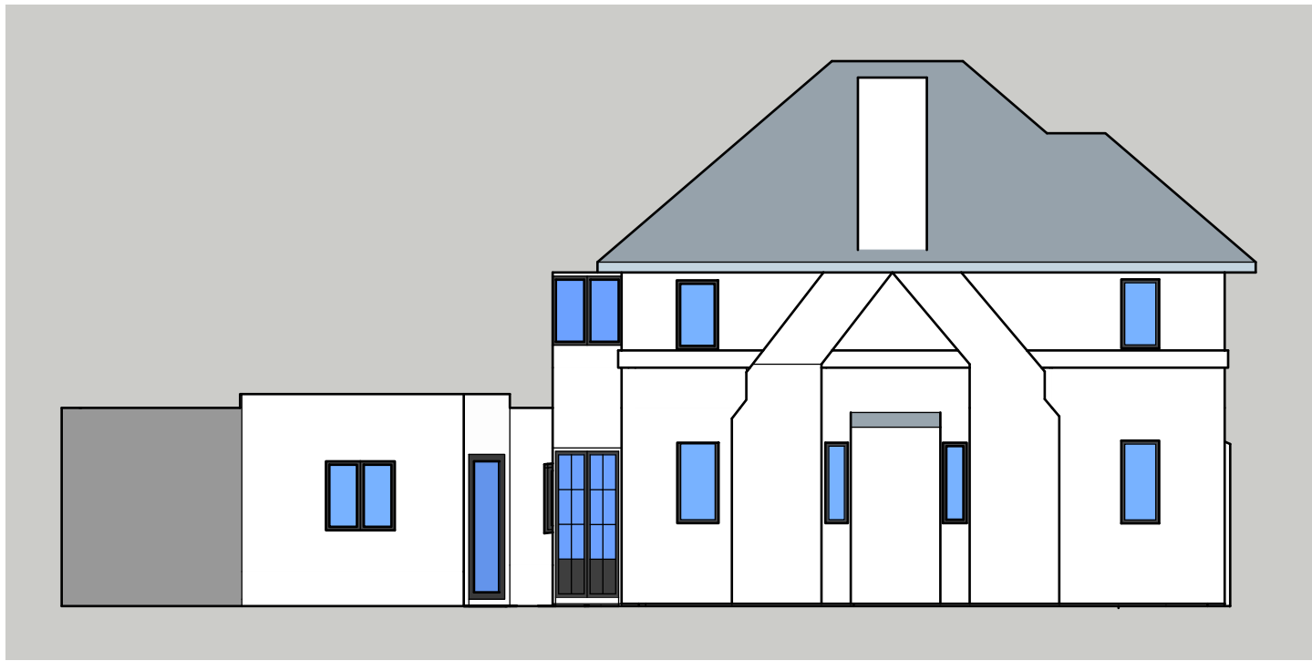
Existing Side Elevation - East