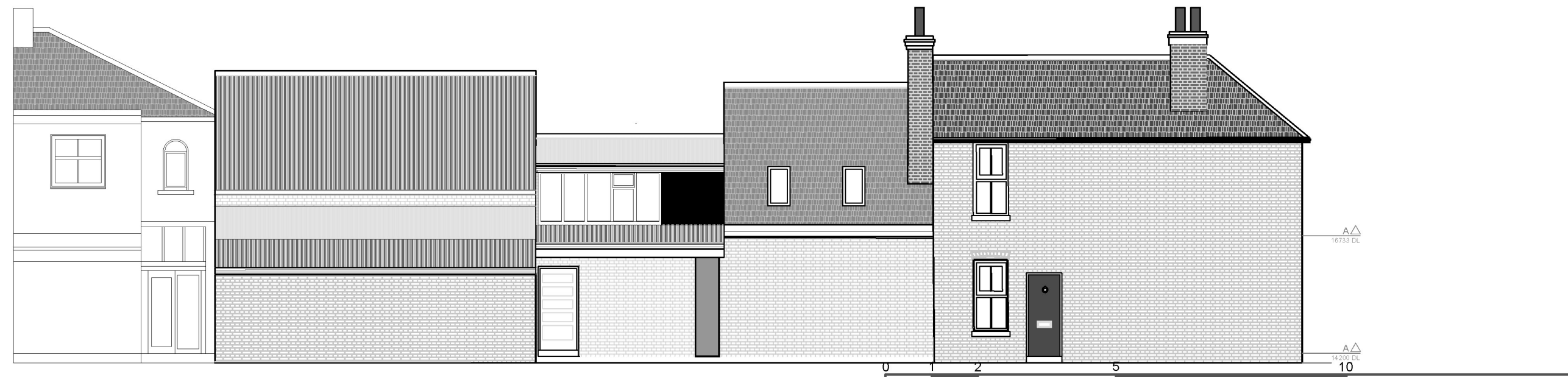
Existing Flank Elevation (West)