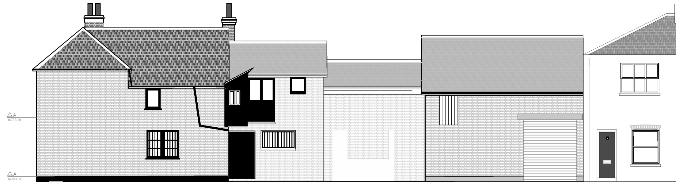
Existing Side Elevation (East)