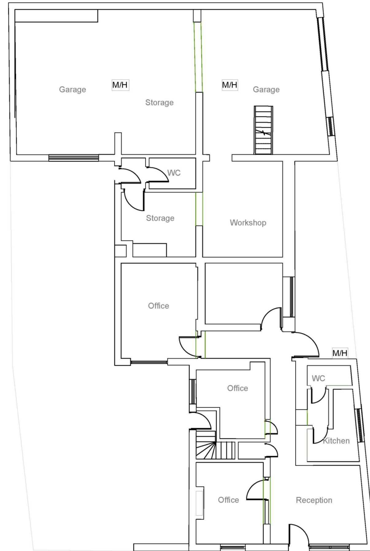
Existing Ground Floor