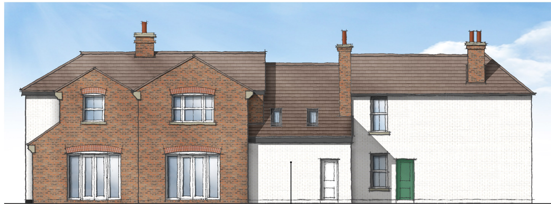
Rear Elevation May Road