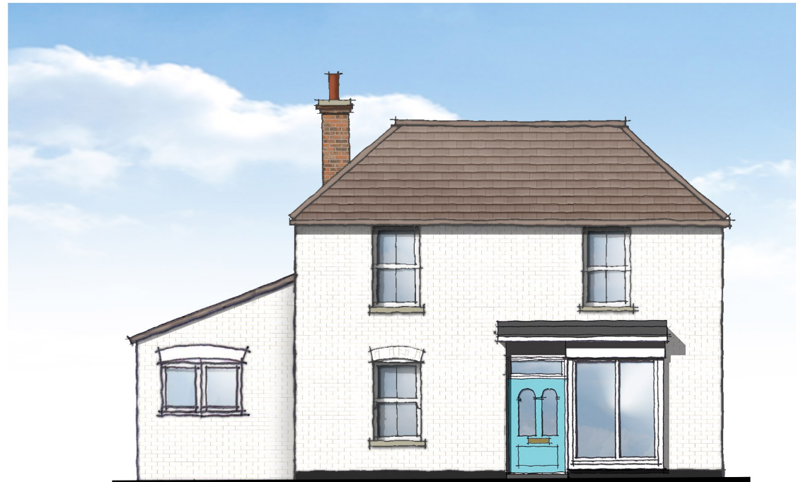
Front Elevation The Green