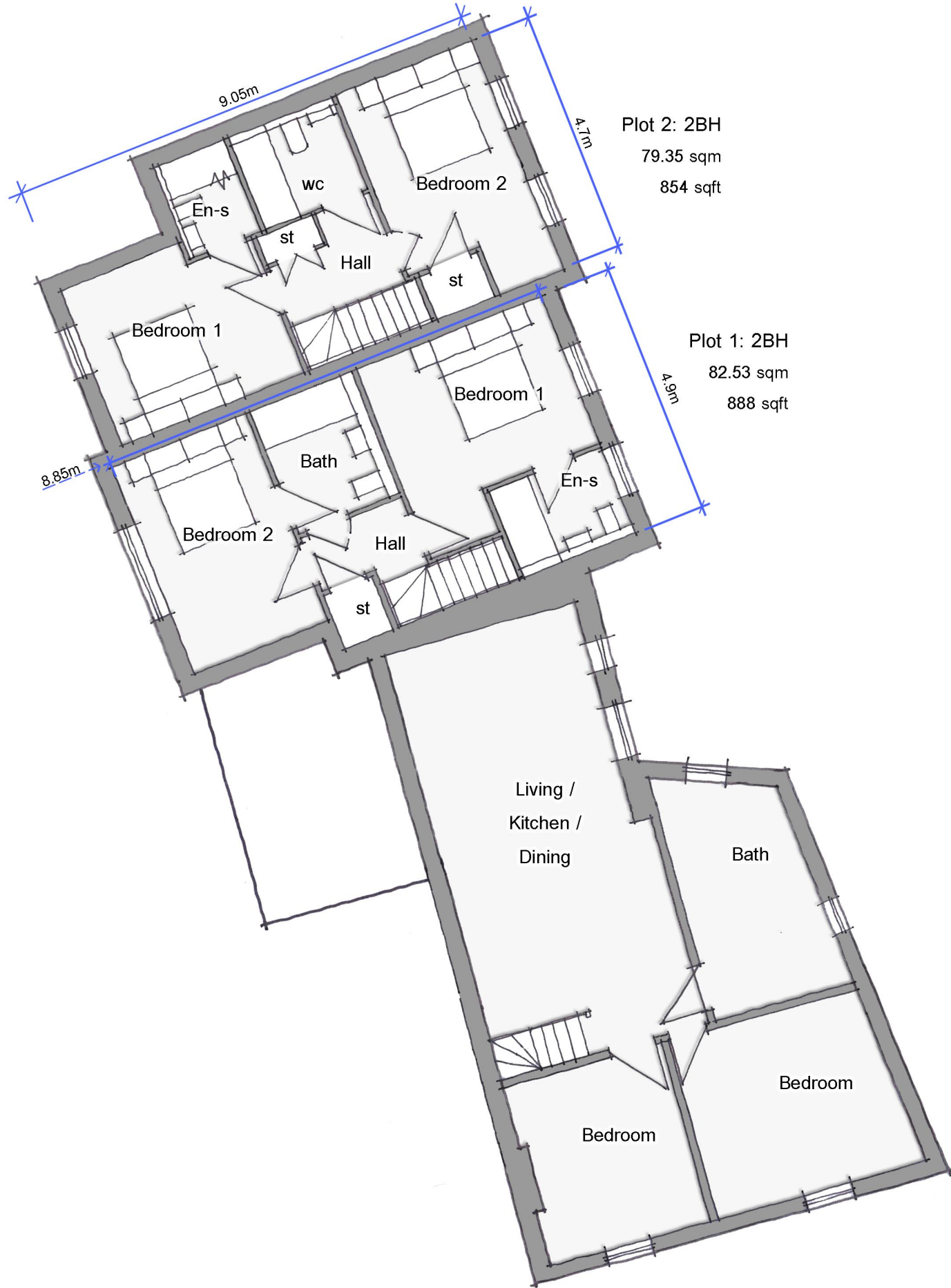
Existing First Floor Apartment