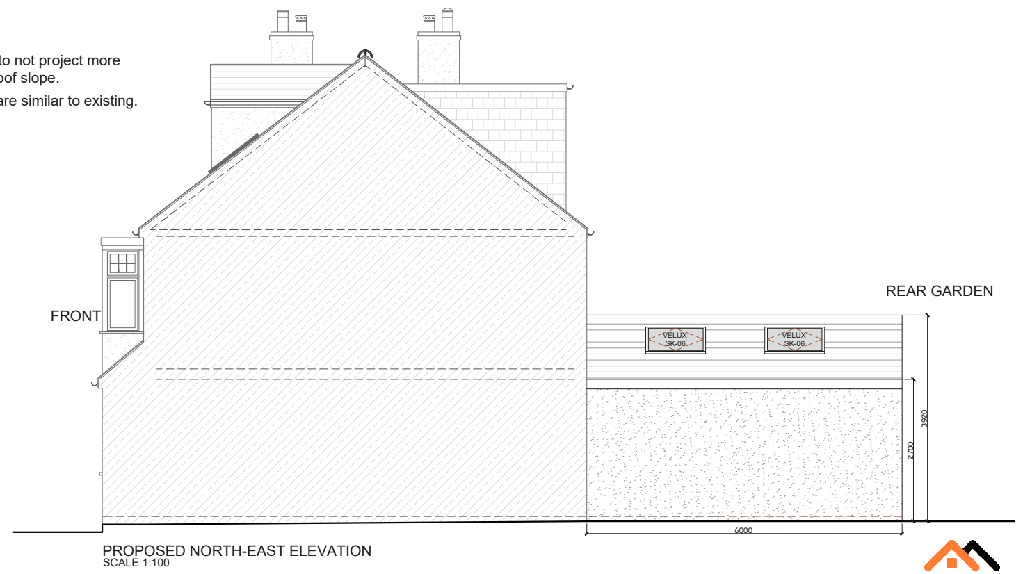
PROPOSED NORTH-EAST ELEVATION SCALE 1:100

Skylight/Roof windows to not project more than 150mm from the roof slope. All proposed materials are similar to existing.