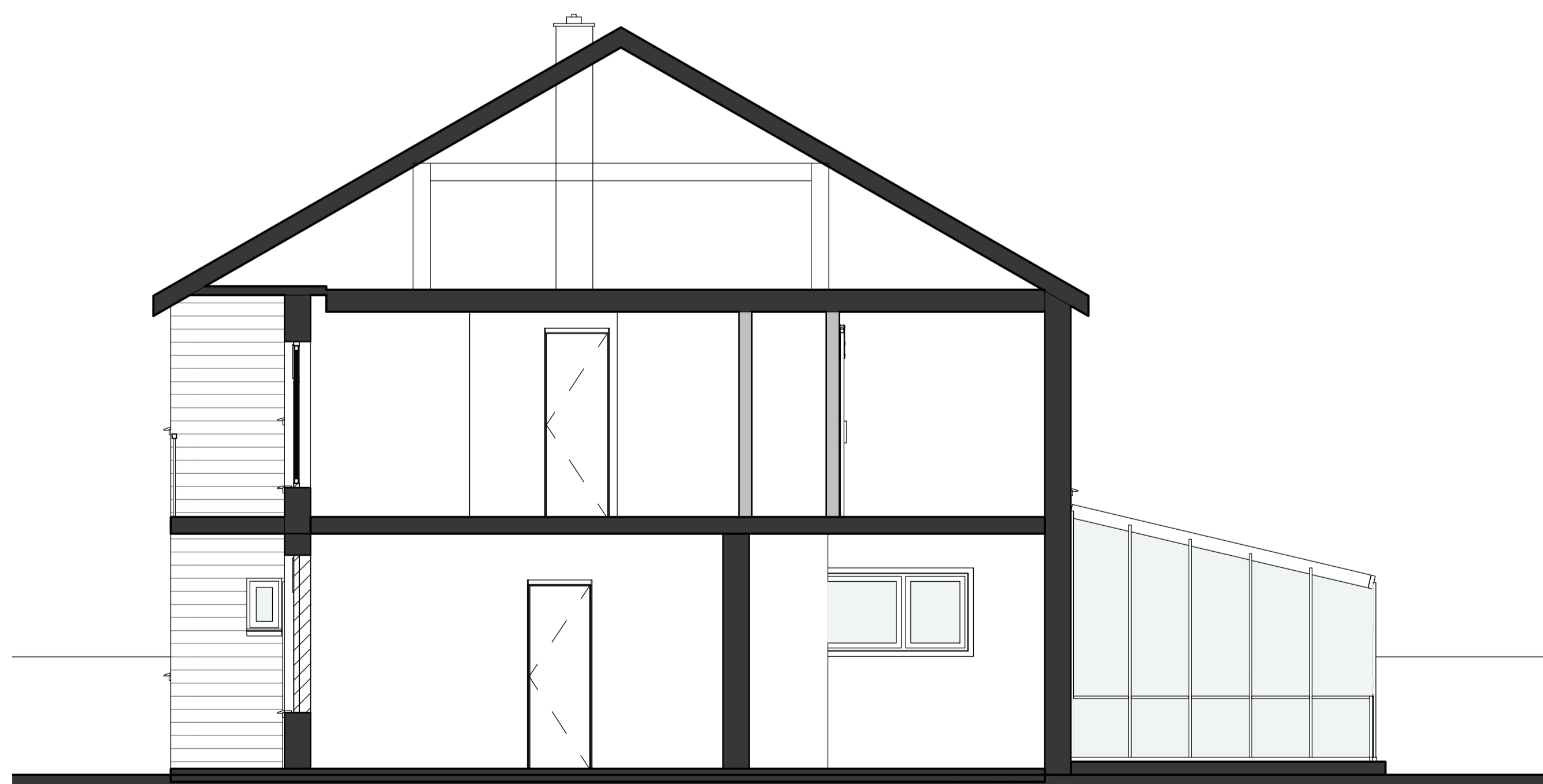
2 Existing Section B-B 1 : 50