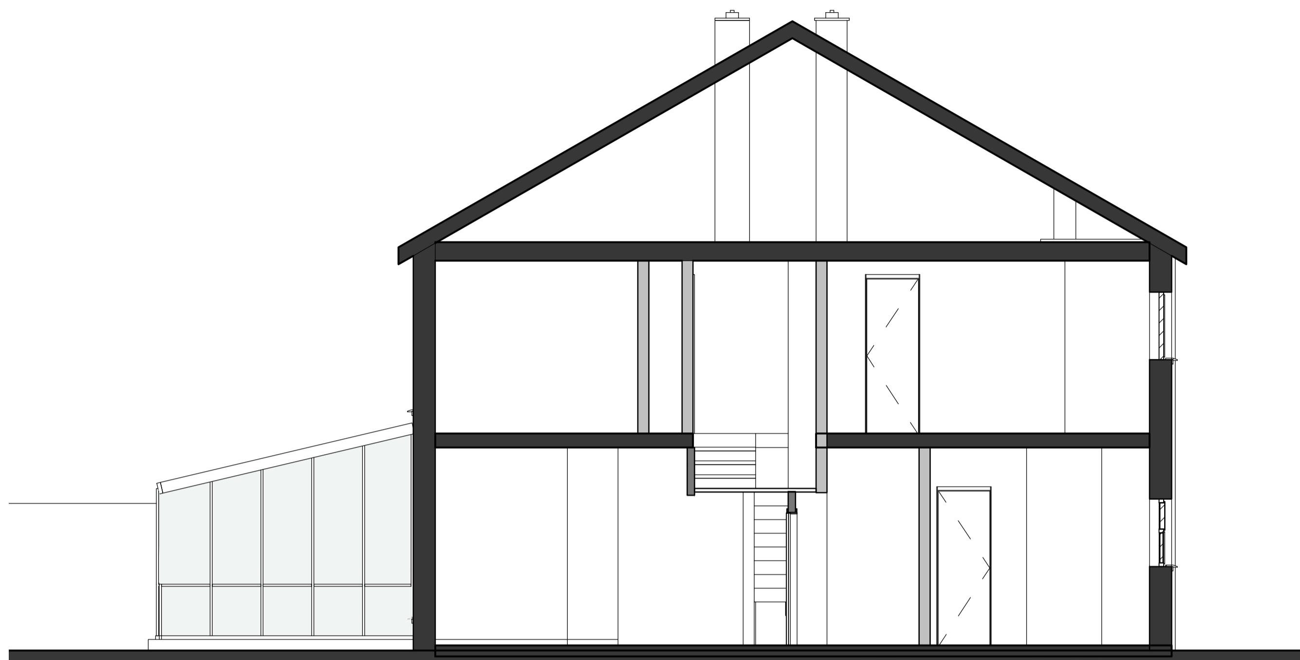
1 Existing Section A-A 1 : 50