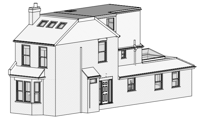
3D View 1