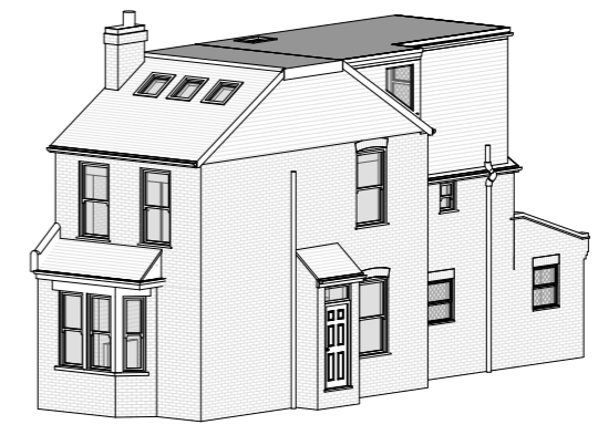
3D View 1