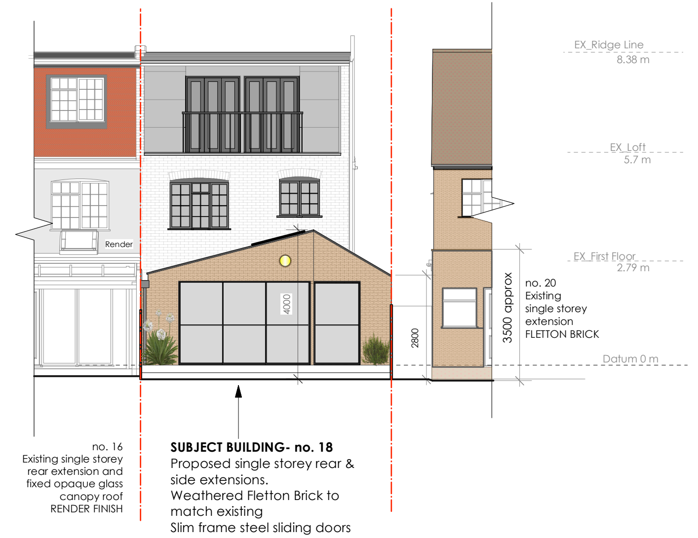
REAR ELEVATION Proposed