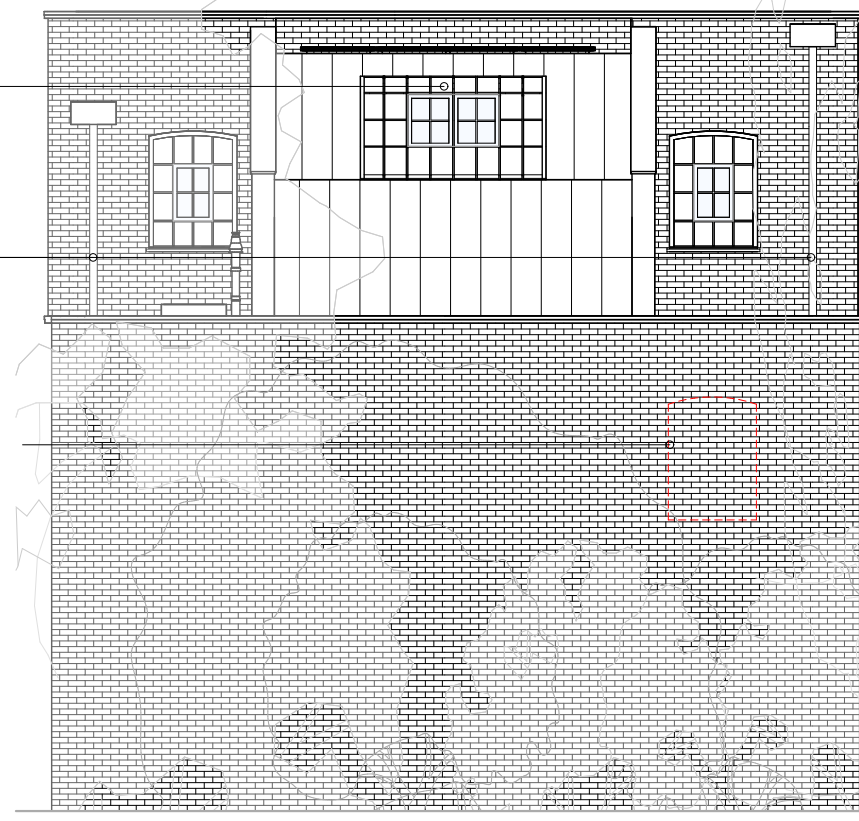
2 GA Proposed South Elevation 1 : 100