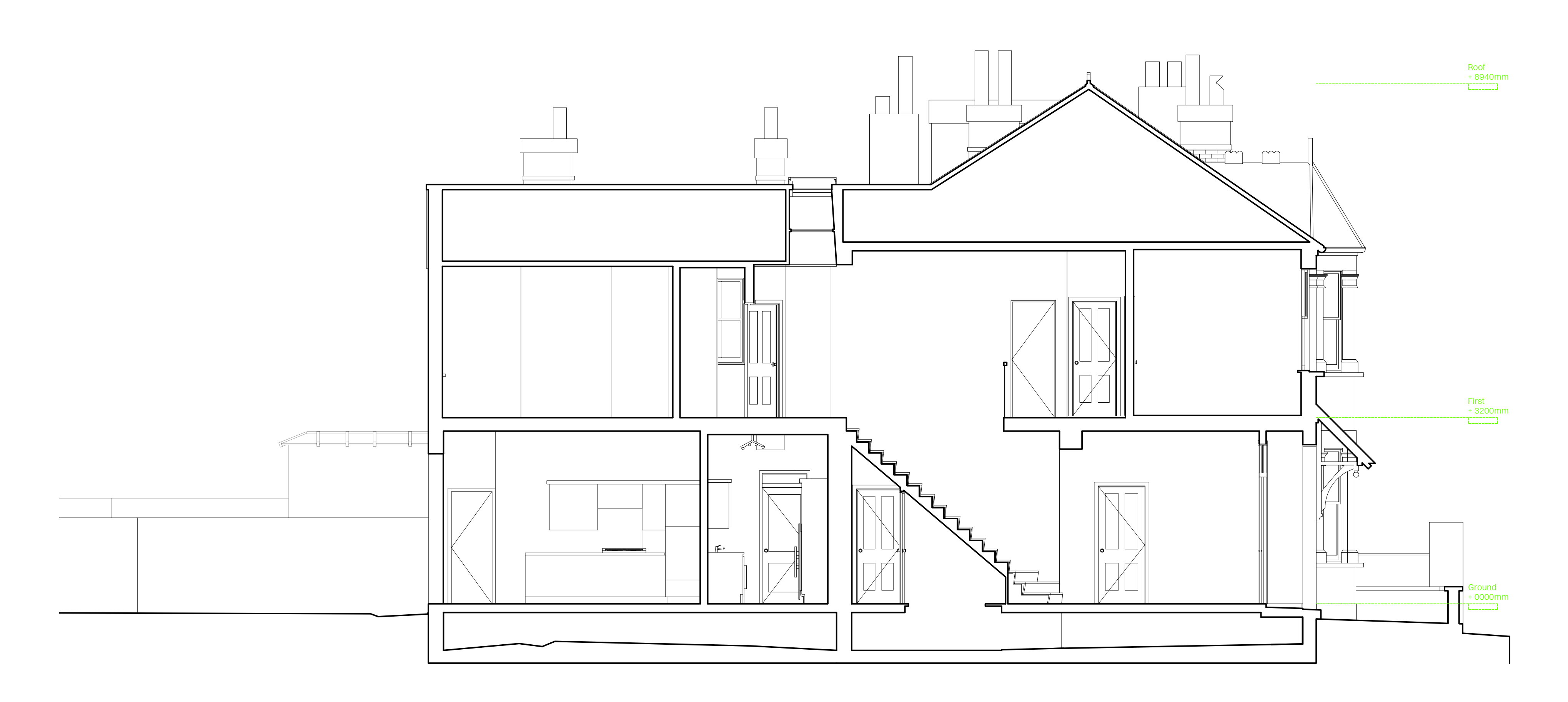
Existing Section - AA 1:50