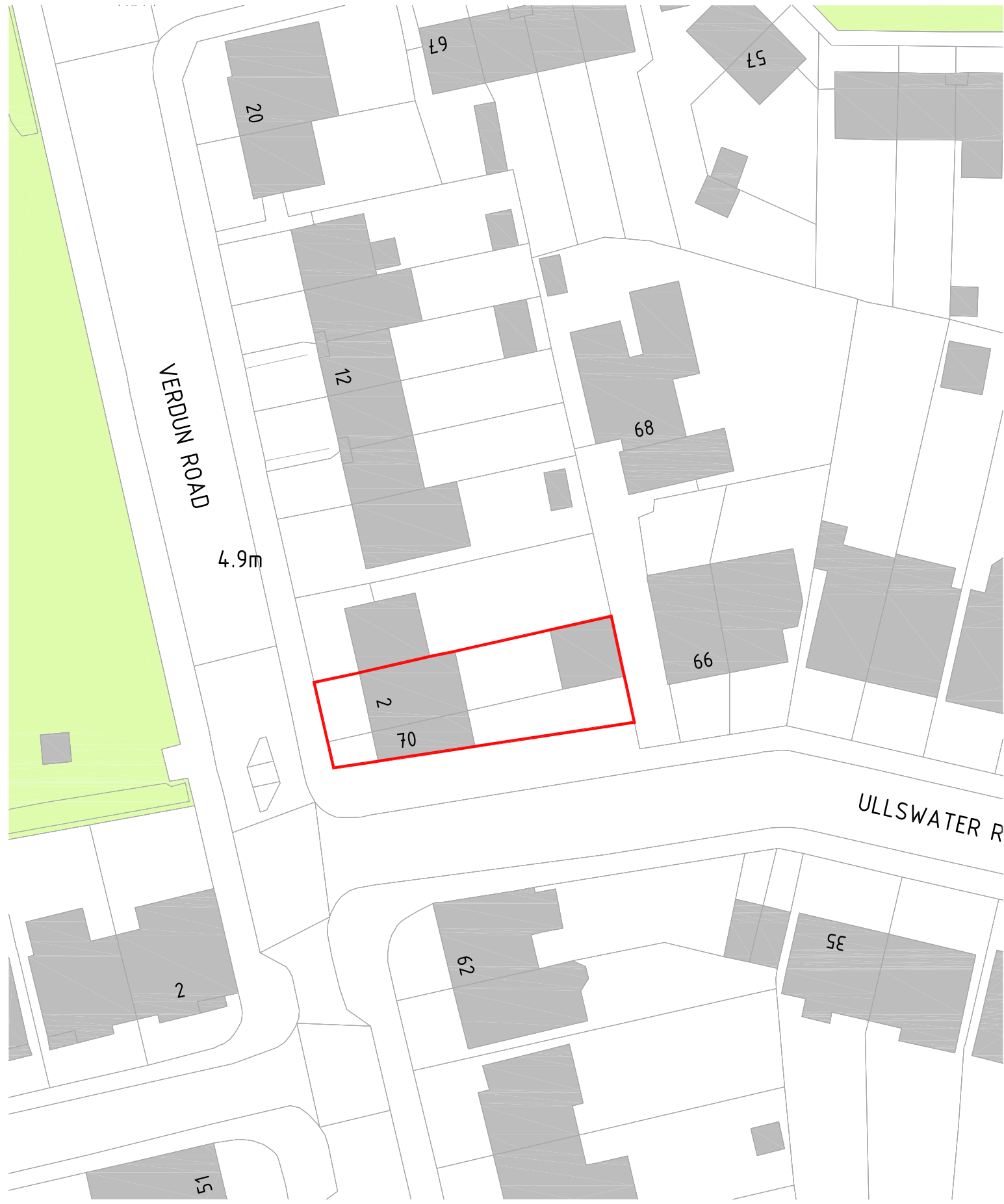
BLOCK PLAN scale 1:500