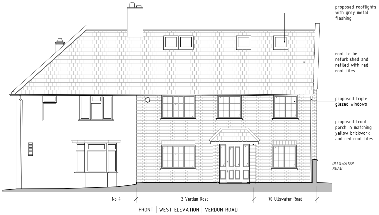
FRONT | WEST ELEVATION | VERDUN ROAD