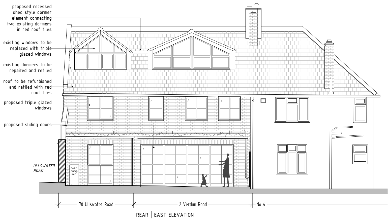
REAR | EAST ELEVATION

KEY: [Solid Grey Box] EXISTING [Hatched Box] PROPOSED Note: Surrounding buildings and levels are indicative only, carried out from a visual survey