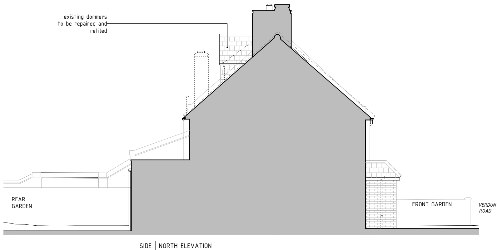
SIDE | NORTH ELEVATION