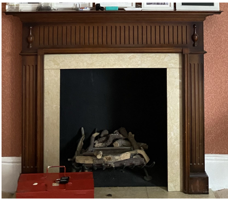
20 TH C REPRODUCTION TIMBER SURROUND