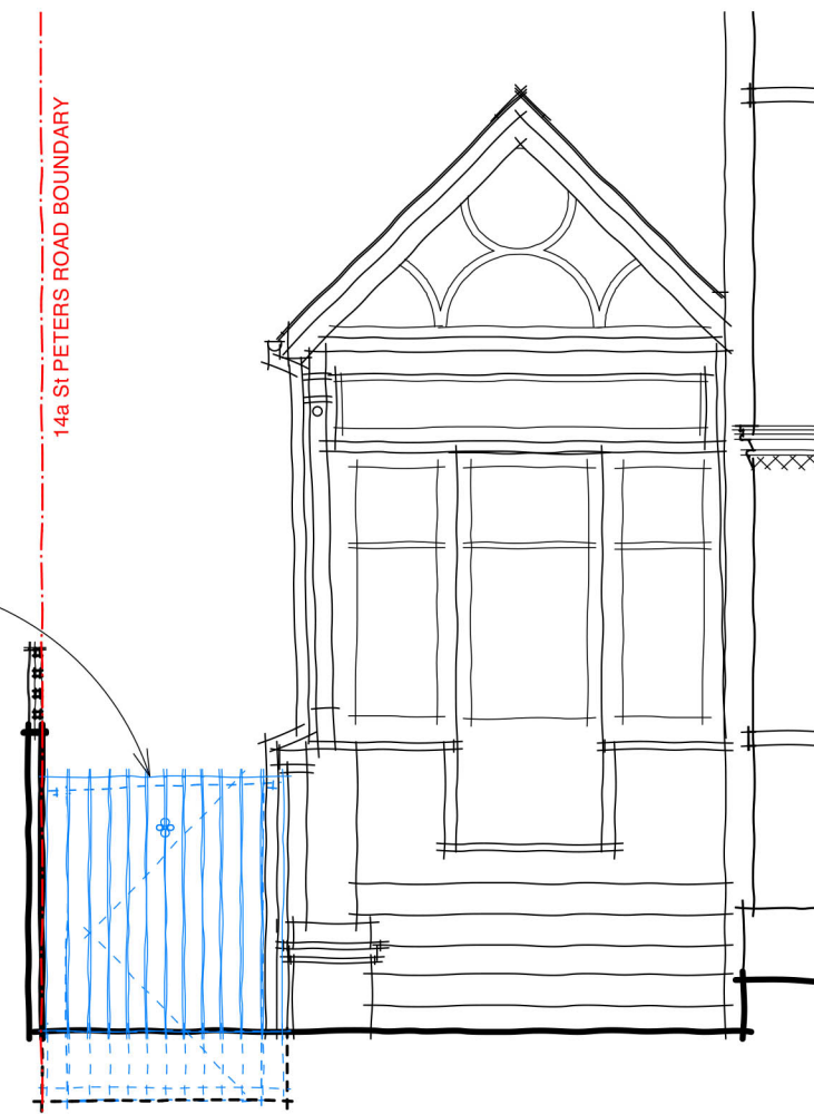
04. PART ELEVATION (1:50)