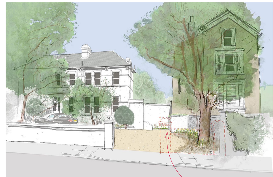
02. VIEW FROM ROAD (nts)

Showing proposed bin store in context. Please refer to BHA Drawing Su18 for existing context photographs