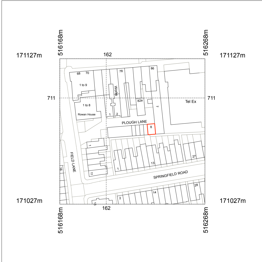
ORDNANCE SURVEY EXTRACT : SITE PLAN

SITE ADDRESS: 8 PLOUGH LANE, TEDDINGTON, MIDDLESEX, TW11 9BN