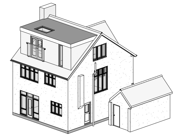
3D View 2