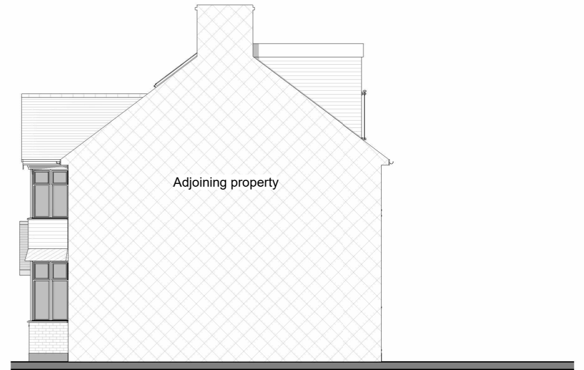
Side 1 Elevation