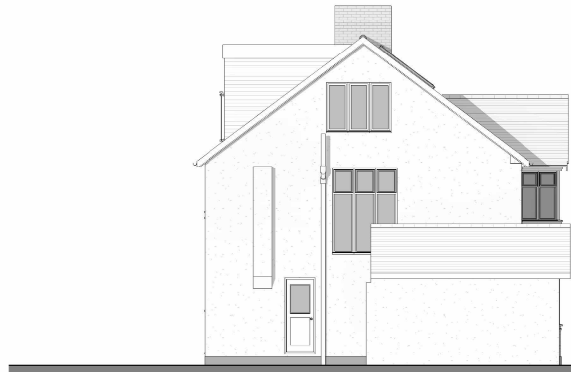
Side 2 Elevation