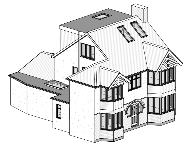
3D View 1