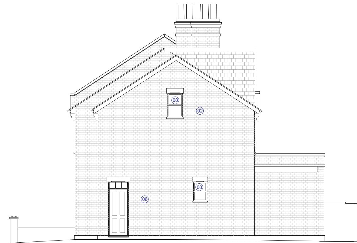
A3 1:100 PROPOSED SIDE ELEVATION