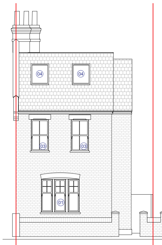
A3 1:100 PROPOSED FRONT ELEVATION