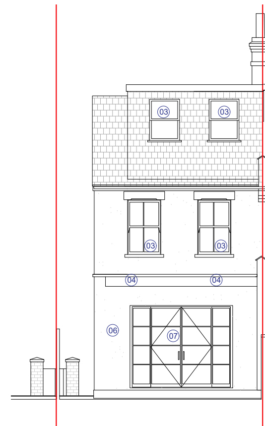
A3 PROPOSED REAR ELEVATION 1:100