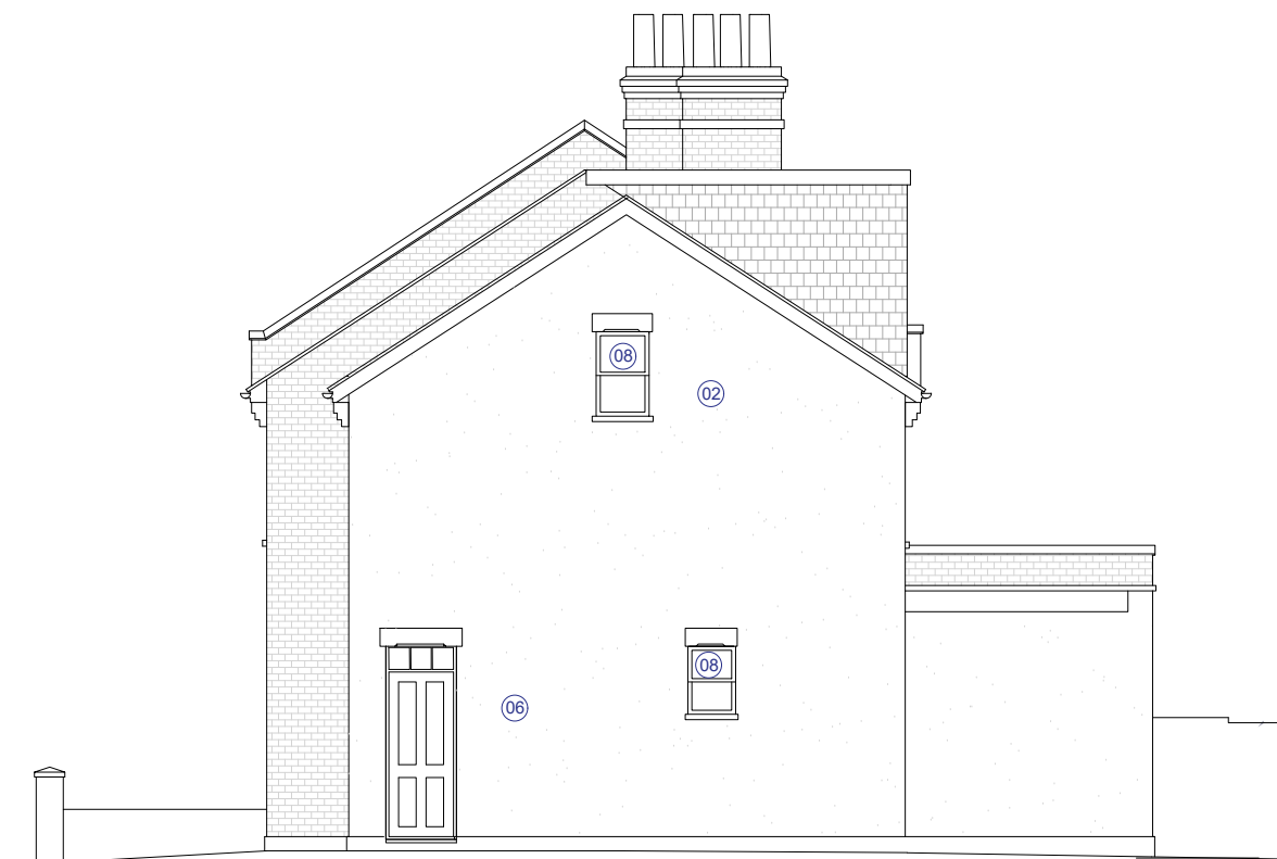
A3 PROPOSED SIDE ELEVATION 1:100