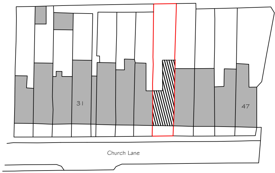
EXISTING BLOCK PLAN SCALE : 1 : 5 0 0