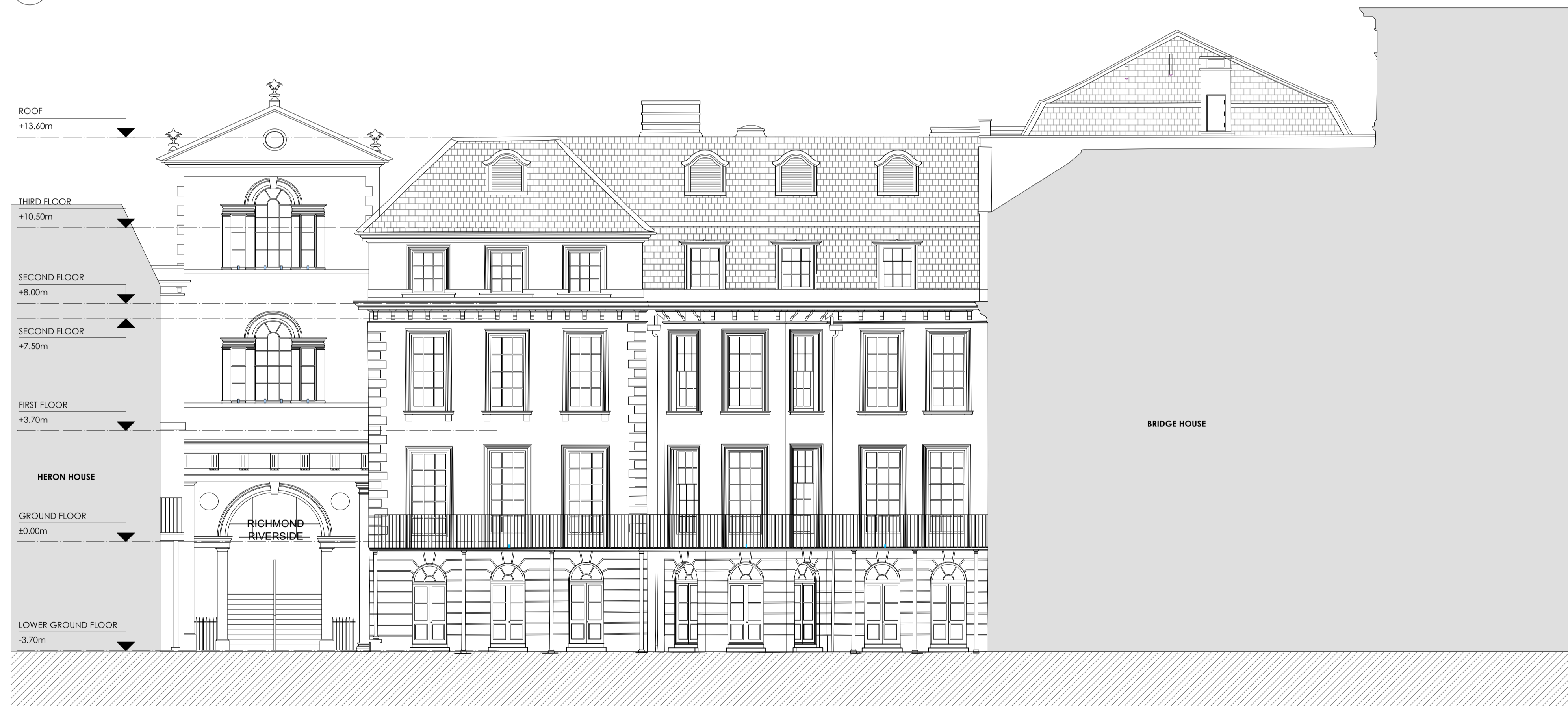
2 EXISTING SOUTH-EAST ELEVATION 1:100