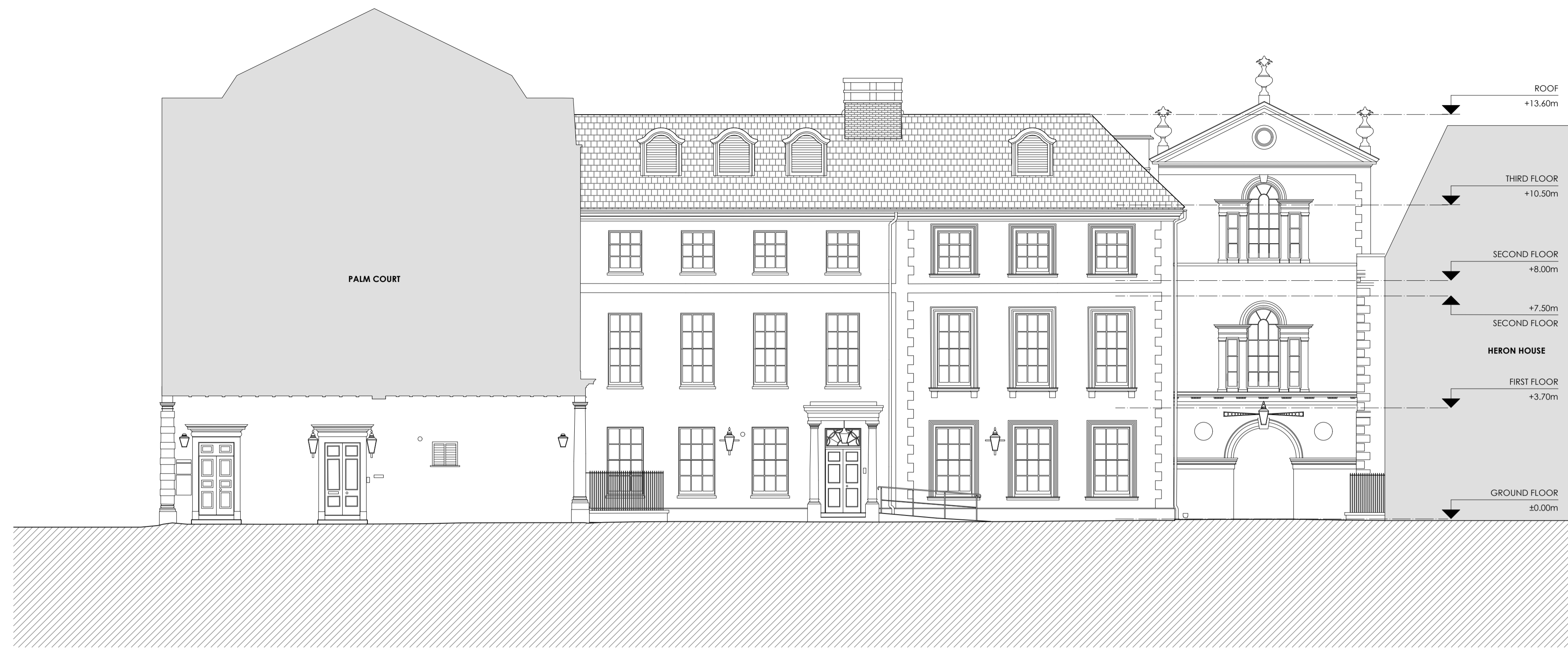
1 EXISTING NORTH-EAST ELEVATION 1:100