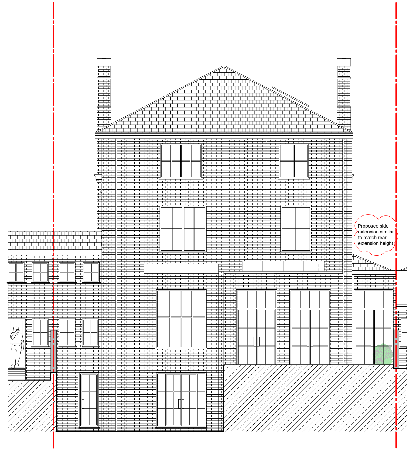
PROPOSED REAR ELEVATION SHOWING HIDDEN LOWER GROUND LEVEL