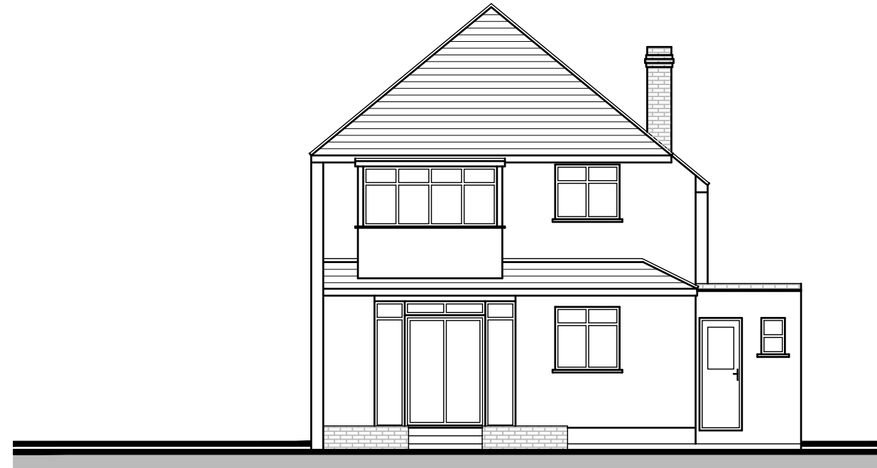
EXISTING REAR ELEVATION 1:100