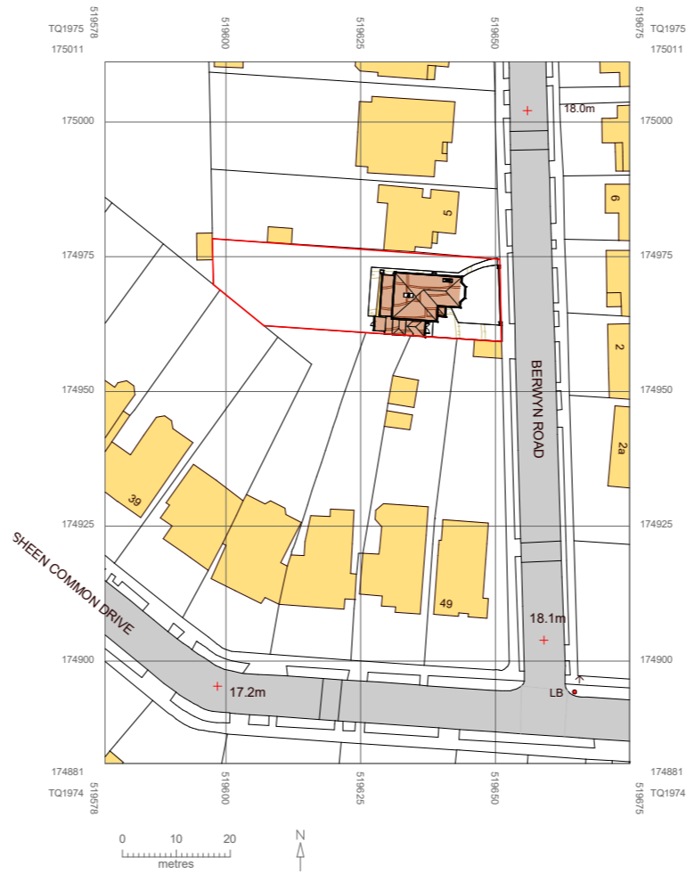
① Site Location 1 : 1250