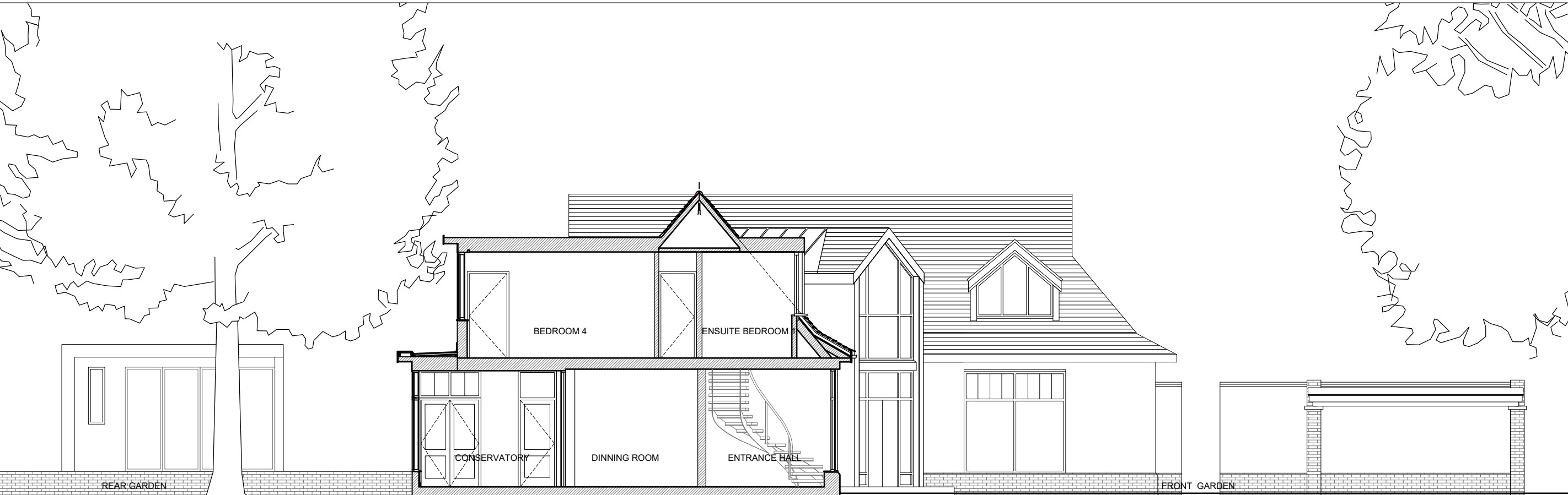
EXISTING SECTION A-A'