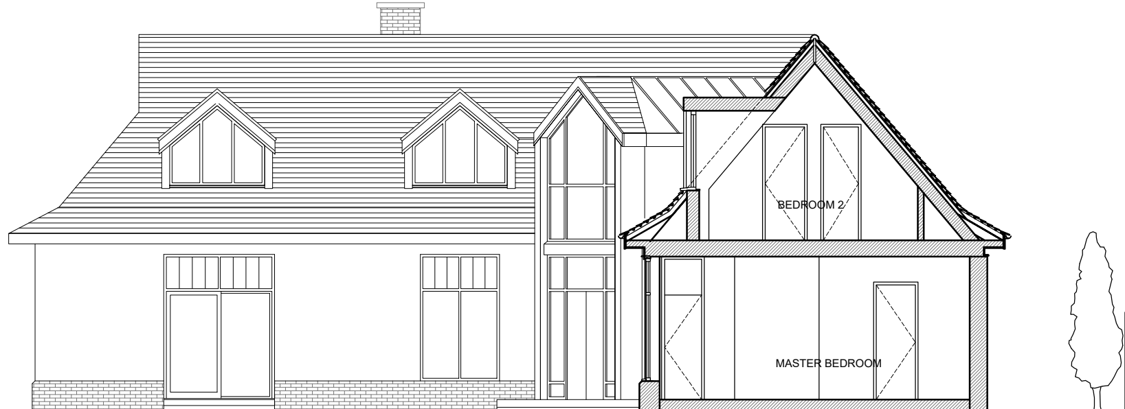
EXISTING SECTION B-B'