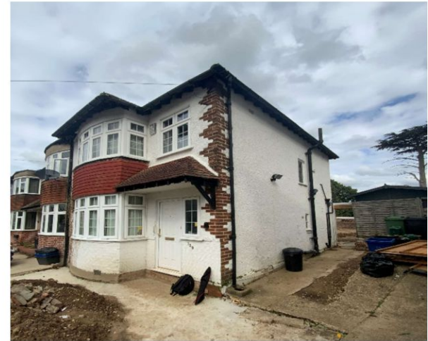
Image of Front Elevation