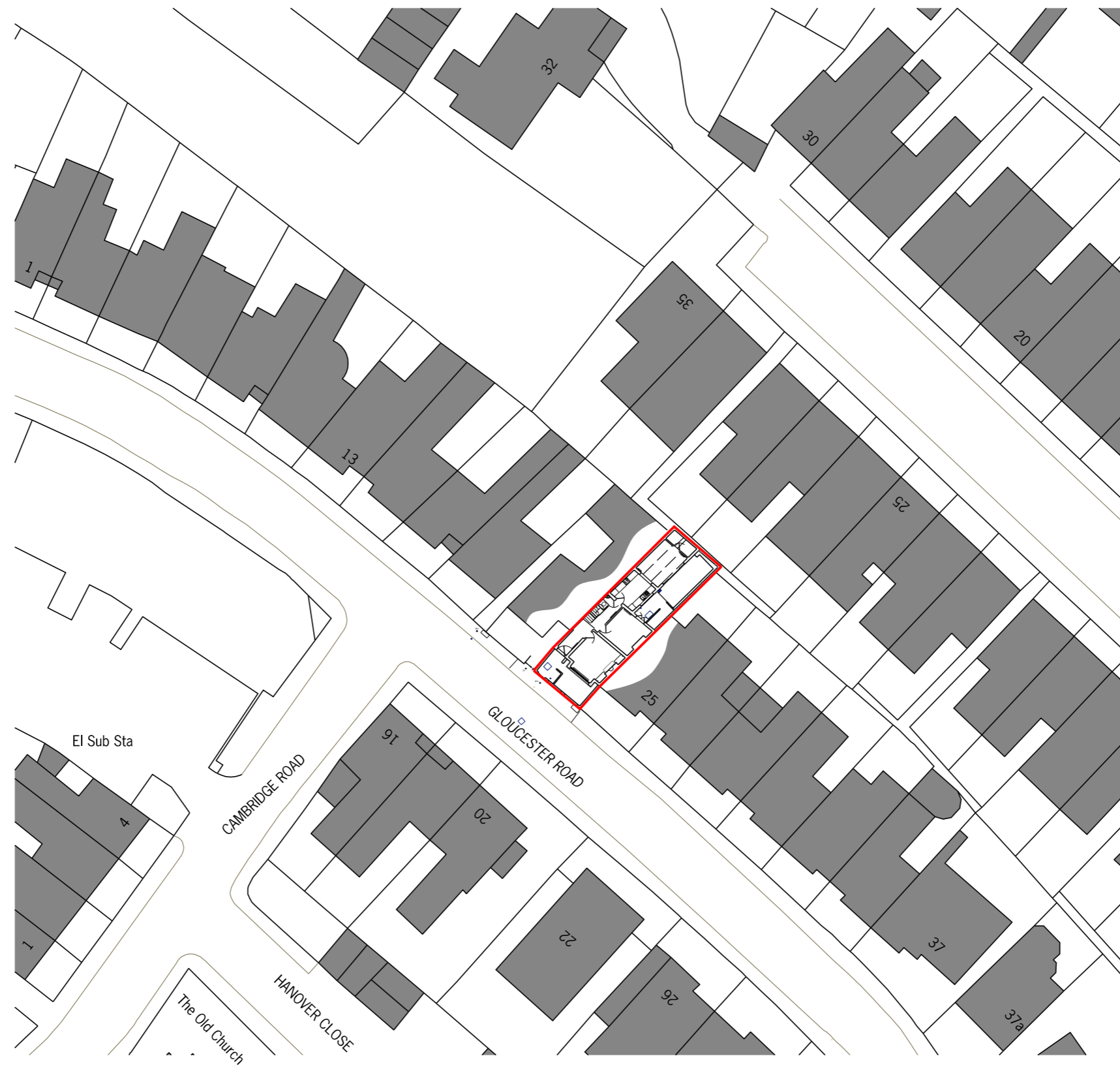
01 Existing Block Plan 1:500@A3