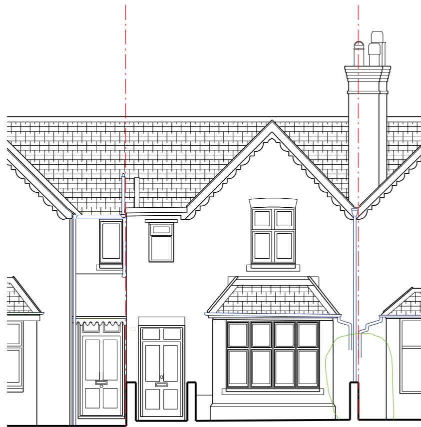
01 Existing Front Elevation 1:100@A3