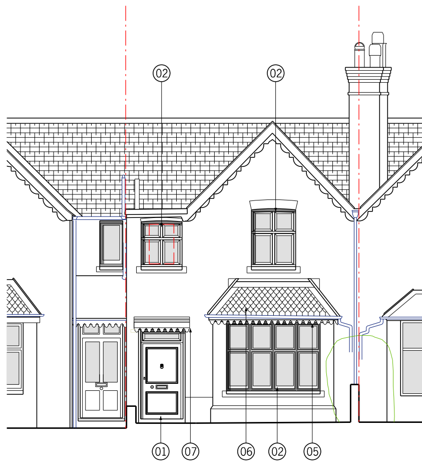
01 Proposed Front Elevation 1:100@A3