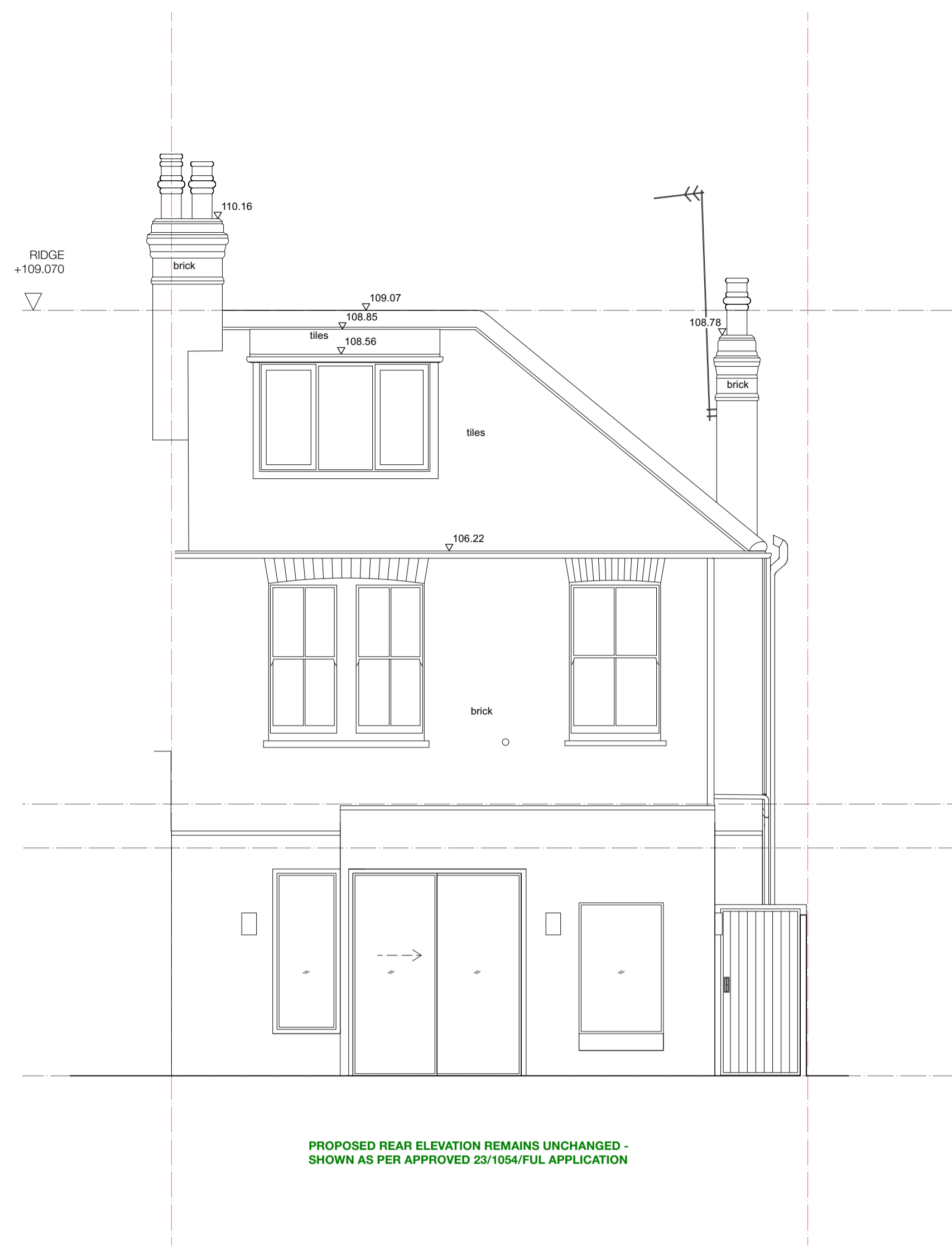
REAR ELEVATION (NORTH- EAST)