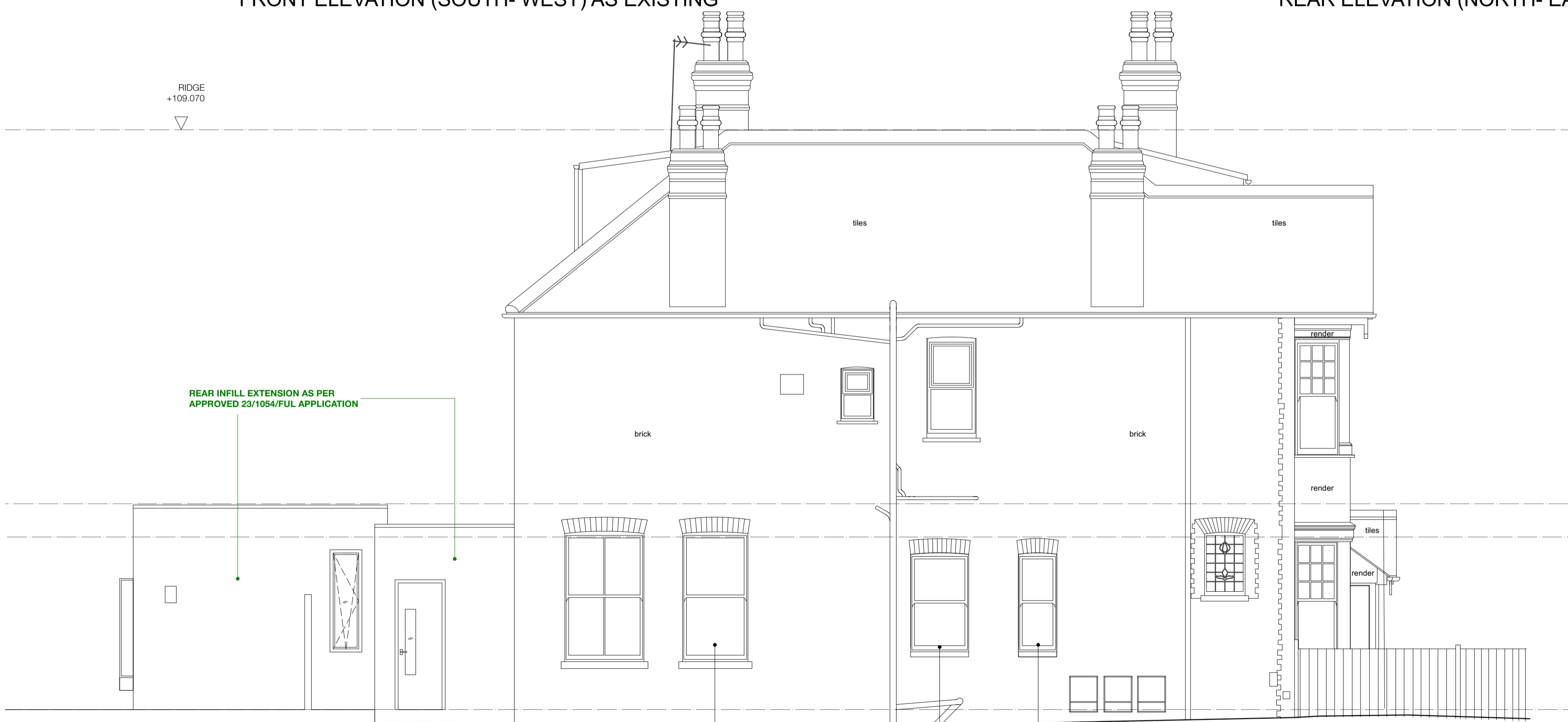
SIDE ELEVATION (NORTH- WEST)

NEW OBSCURED GLAZED TIMBER SASH WINDOW, SIZE AND APPEARANCE TO MATCH EXISTING WINDOWS