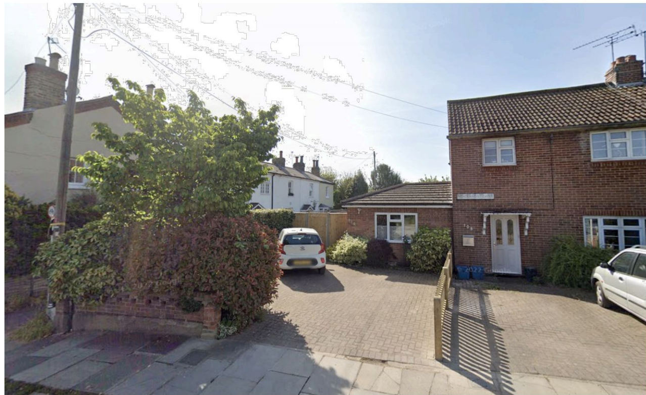
View from Meadlands Drive