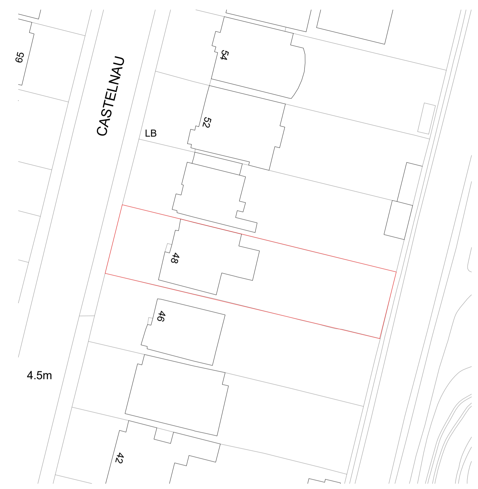
BLOCK PLAN 1 : 500