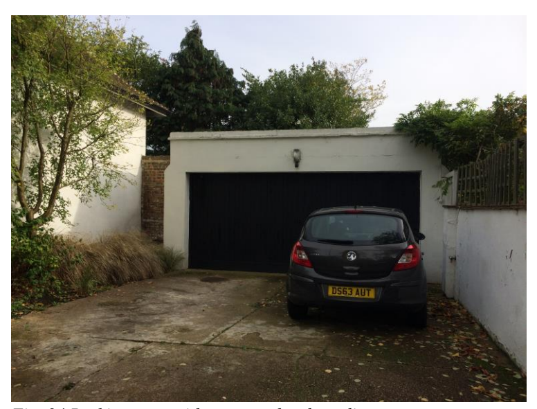
Fig. 04 Parking area with concrete hardstanding

4.6 Upper Ham Road is a busy roadway, and the constrained access has led to several near misses with cars and cyclists.