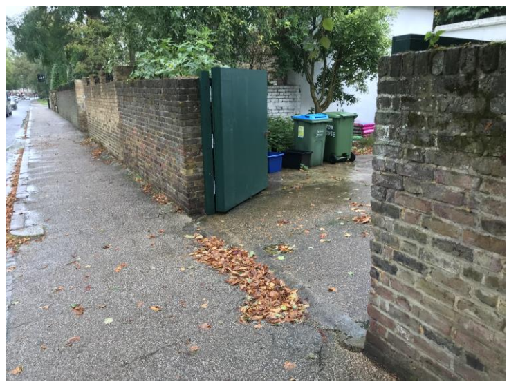
Fig. 03 Existing opening with timber gates

4.6 Upper Ham Road is a busy roadway, and the constrained access has led to several near misses with cars and cyclists.