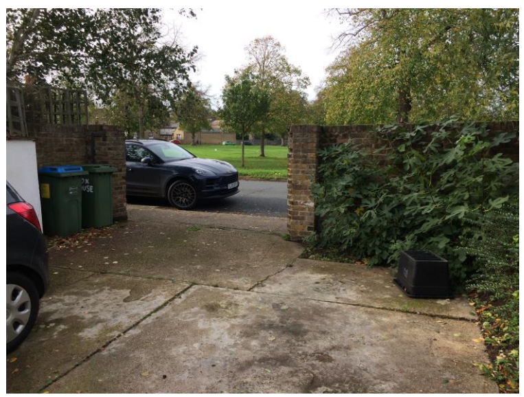
Fig. 05 Internal view of parking area.