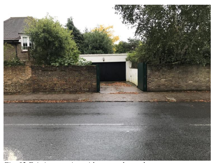
Fig. 02 Existing opening with garage beyond

4.1 The parking area associated with the property is approximately 60m2 and has concrete hardstanding.