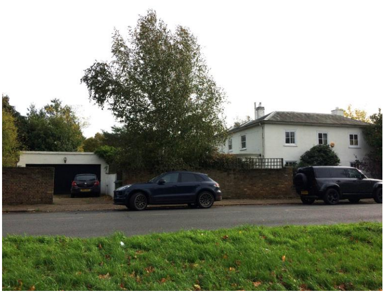
Fig. 06 View of existing access and Fox House visible to the right.