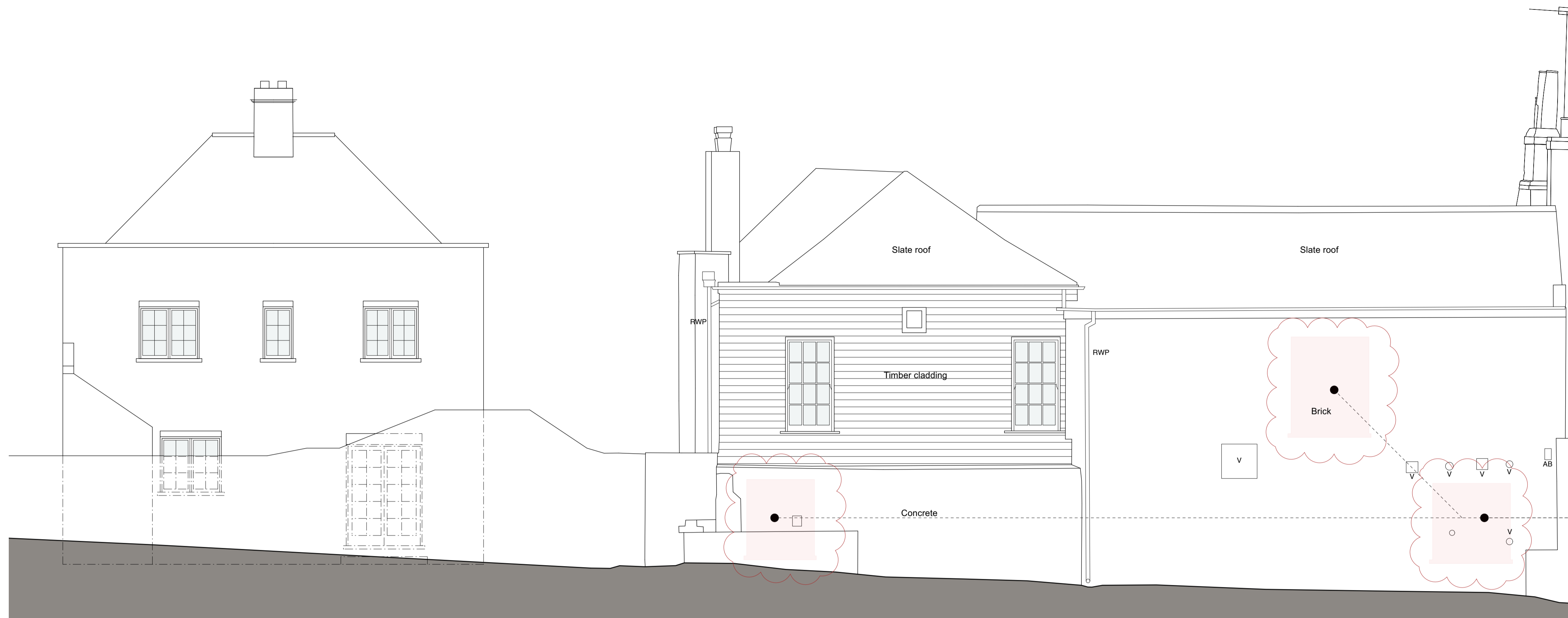
8 Church Walk, Church Cottage

Indicates areas of demolition shown in elevation Indicates areas of demolition shown in section