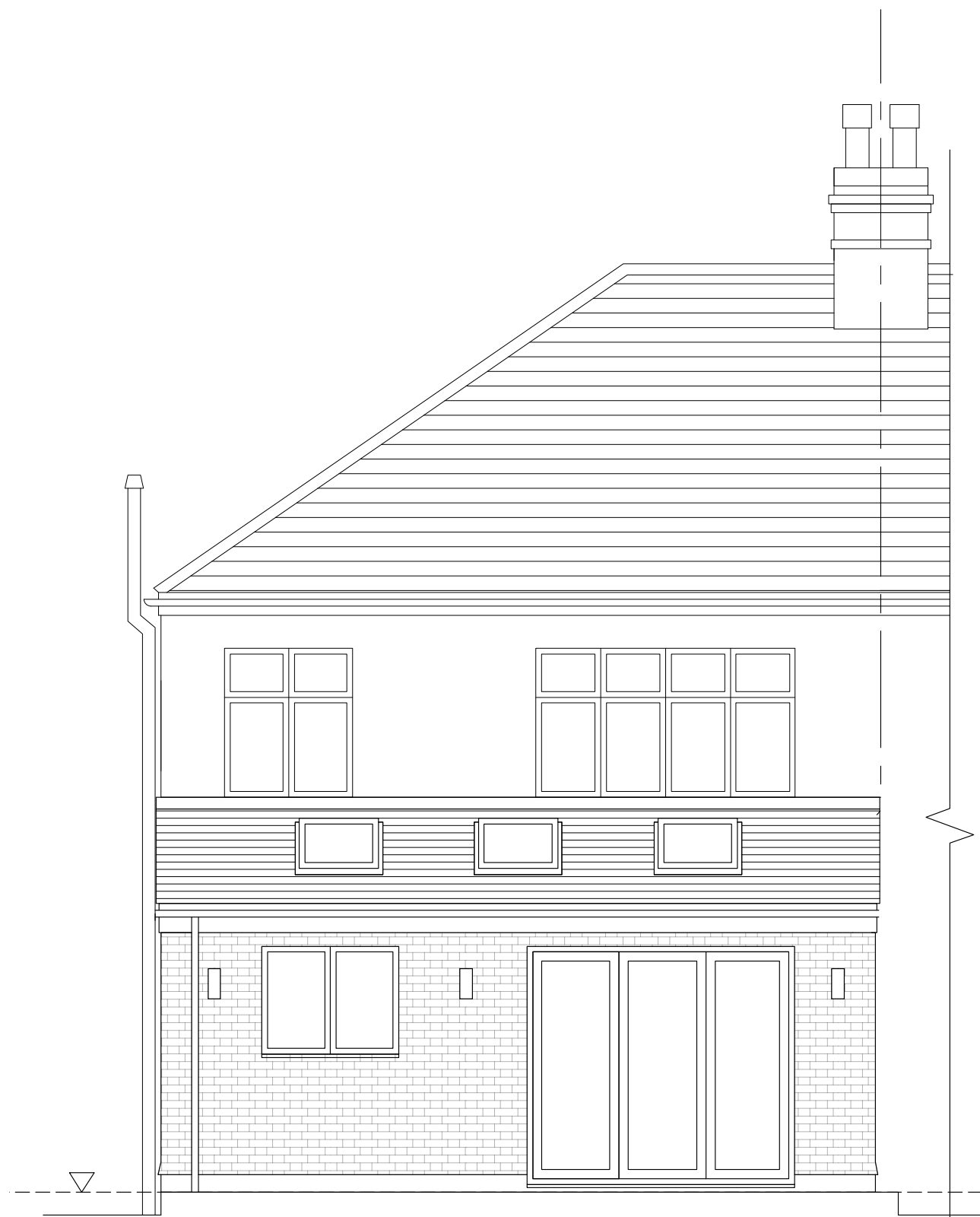
02 Existing Rear Elevation 1:50 @ A3