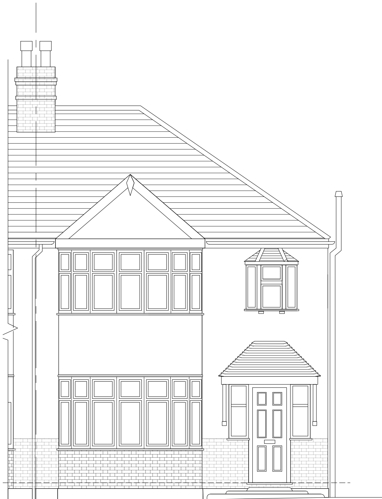
01 Existing Front Elevation 1:50 @ A3