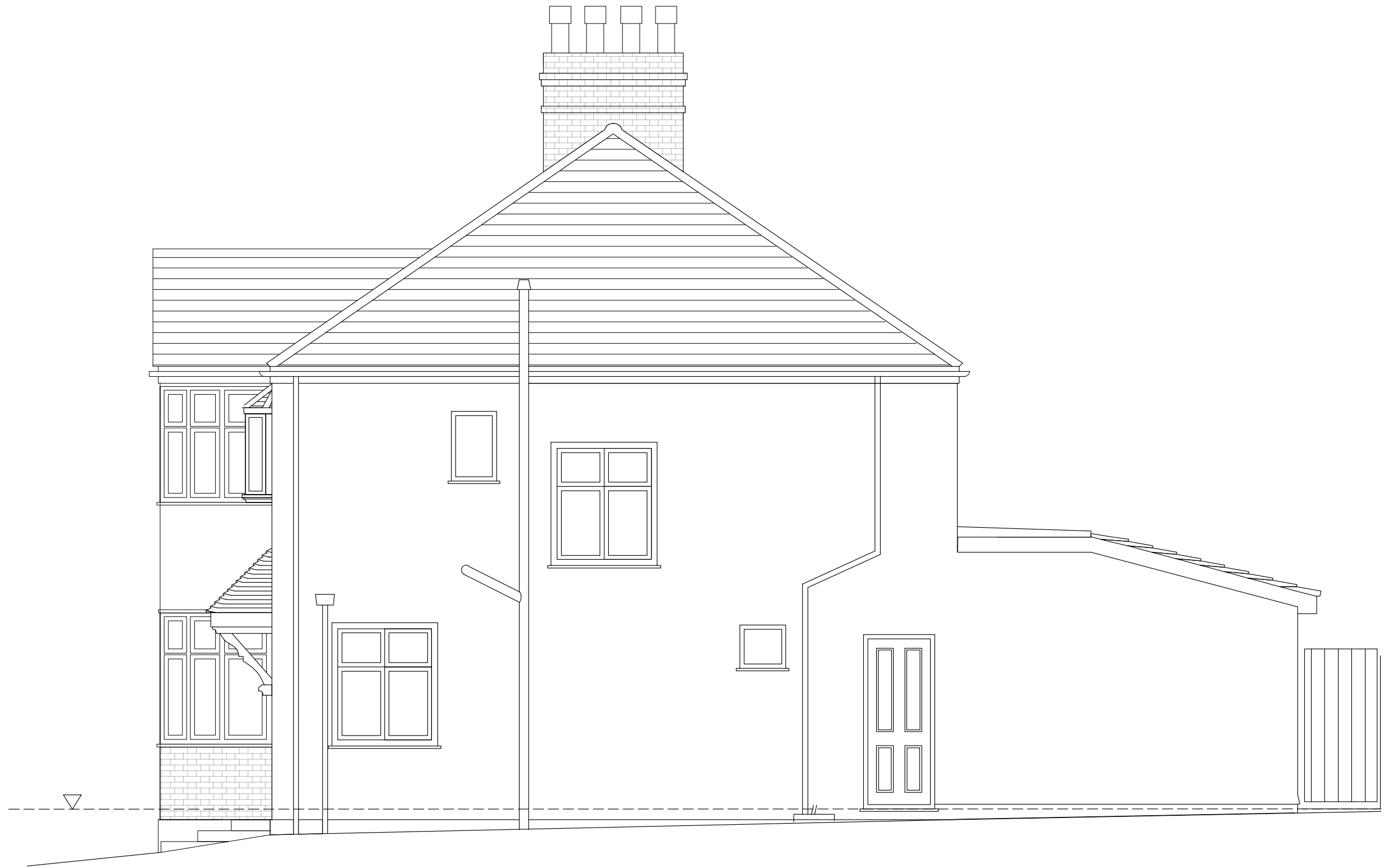
01 Existing Side Elevation 1:50 @ A3