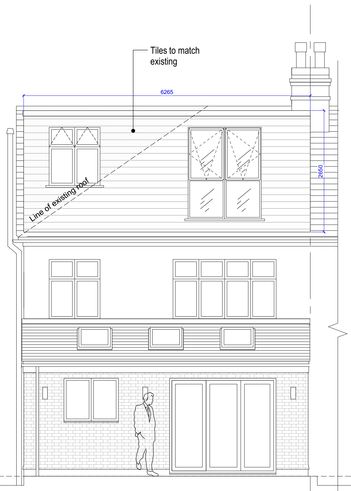
02 Proposed Rear Elevation 1:50 @ A3