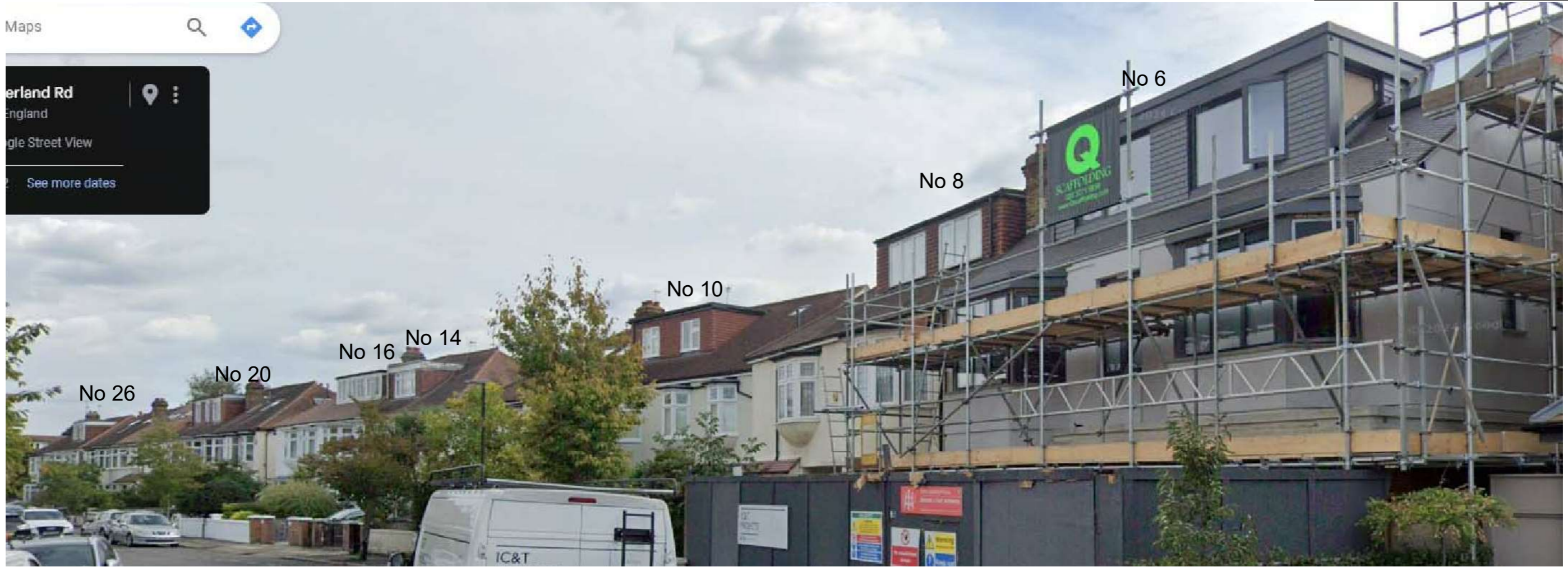
PHOTOGRAPH OF CUMBERLAND ROAD - No's 6 to 20

All dimensions are to be checked on site. All dimensions are in millimetres. All Discrepancies are to be reported to the architect immediately. Drawings marked "planning" or "design" are not to be used for construction purposes. Drawing is to be read with the schedule of work / specification if applicable This drawing is Copyright of J7 Architecture Ltd.