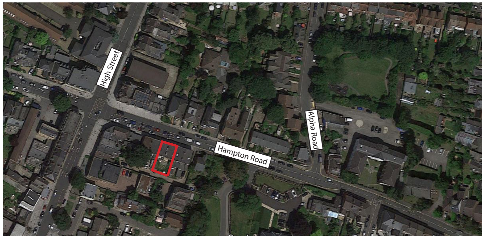
Figure 02 - Site Context

Bushy Park, 600m south of the site, is a short walk away and offers substantial open space and various external amenity activities. Hampton Hill High Street is 50m away offering further shops, cafes and restaurants.