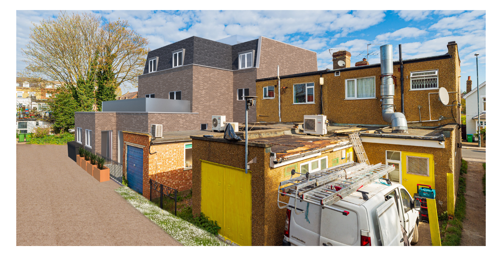
Figure 06 - Amended rear view architectural CGI (subject of this S73 application)