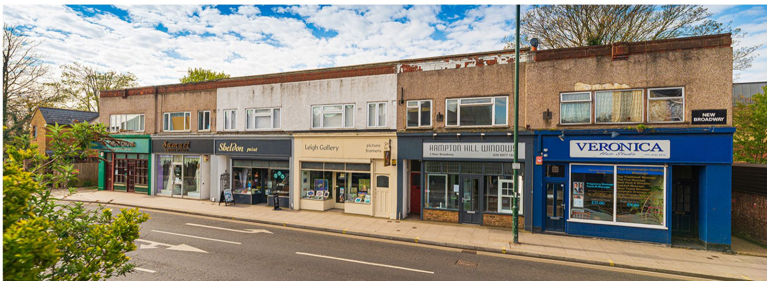
FIGURE 04 - Existing 1-6 New Broadway (no.3&4 in middle)