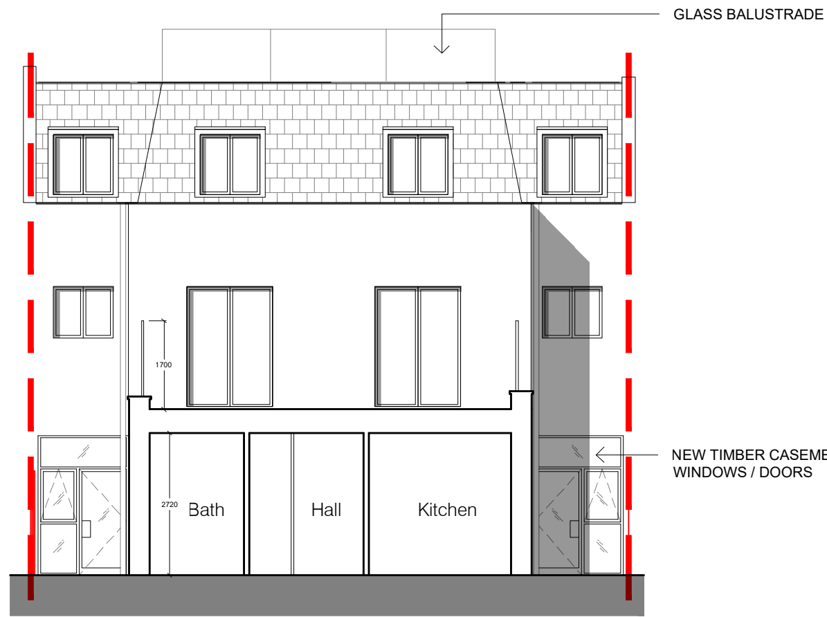
Proposed Section B-B